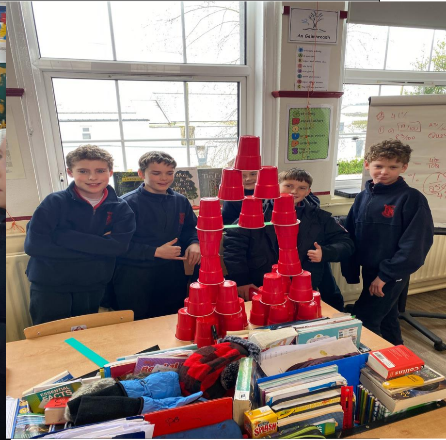
Senior Room Constructions continued.