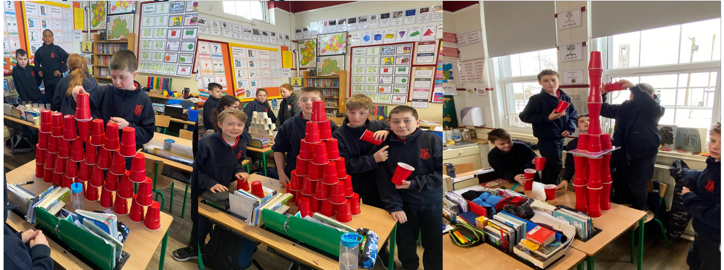
The pupils in the Senior Room used cups and other resources to create elaborate symmetrical structures.