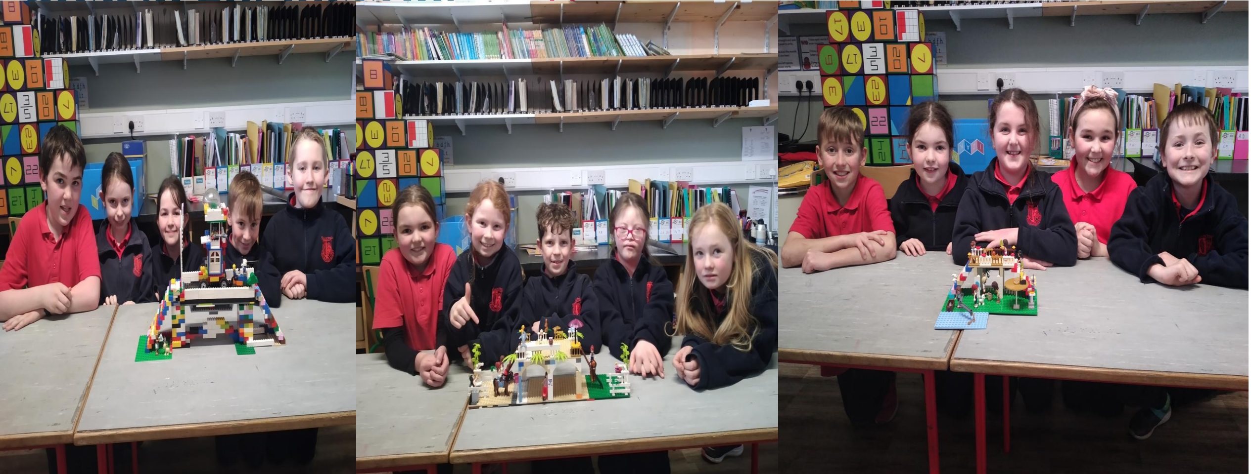
The pupils in the Middle Room would give the famous Engineer and bridge designer Isambard Kingdom Brunel a run for his money with their elaborate bridge designs!